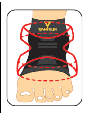
Figure-Eight Taping Structure

The knitted mesh figure-eight wraps around the ankle and foot to provide extra joint support when running, walking and performing daily activities.